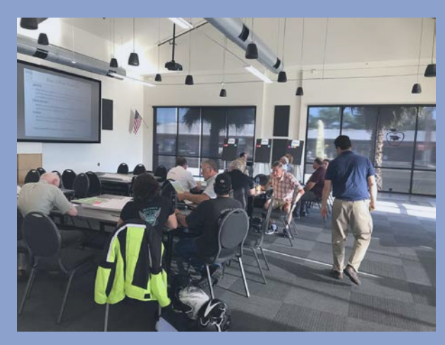
IMPORTANT OUTREACH DOCUMENTS

The County hosted three General Plan Update Visioning Workshops. A summary of community input, comments and concerns are provided in the Outreach Summary Report. The feedback received will be used to memorialize key themes and ideas, and help inform future work tasks associated with the General Plan Update; including the evaluation of opportunities and challenges, land use changes, and the creation of new goals, policies, and actions.